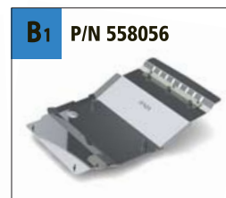
B1 P/N 558056