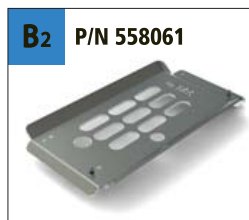
B2 P/N 558061