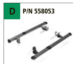
D P/N 558053