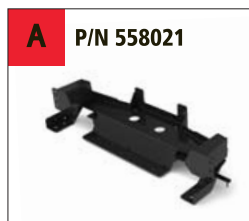
A P/N 558021

A quality towing device mounted to the vehicle's chassis under the original bumper.