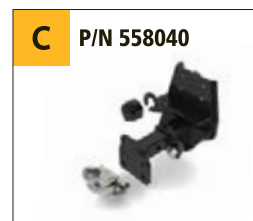
C P/N 558040