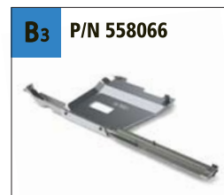
B3 P/N 558066