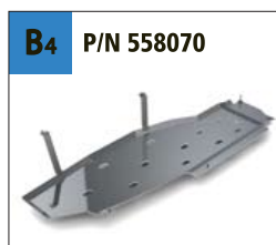
B4 P/N 558070