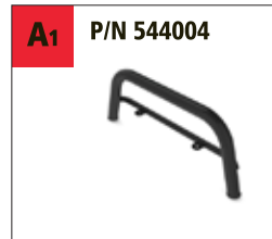
Front Bar for ATL Winch Bumper