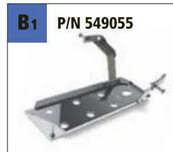
Engine + Gear Skid Plate