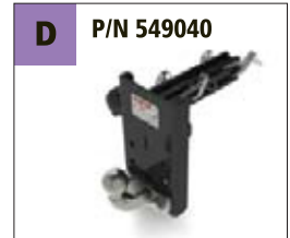
Detachable Tow Bar