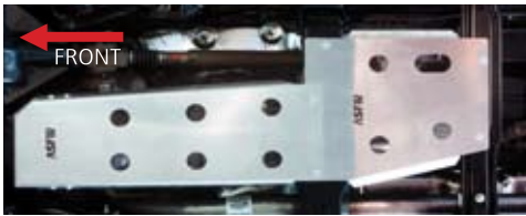
Engine, Gear and Transfer Skid Plates