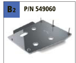
Transfer Skid Plate