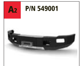
ATL Winch Bumper