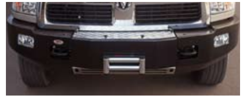
ATL Winch Bumper